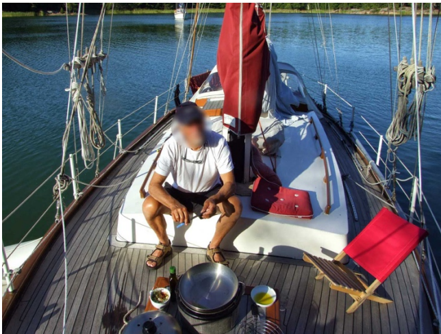
Cooking on Deck