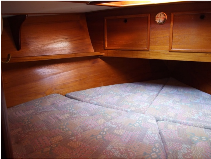
Double beds or 2 single beds with plenty of storage underneath at the side and in the peak