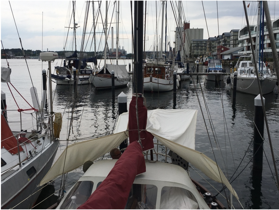
For rainy days, a more heavier roof.