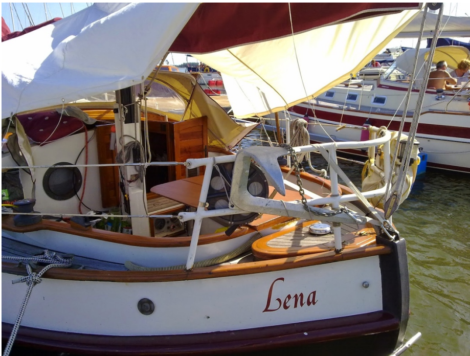
Under the sunroof