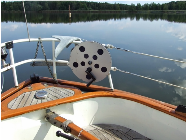
Cockpit stern Anchor