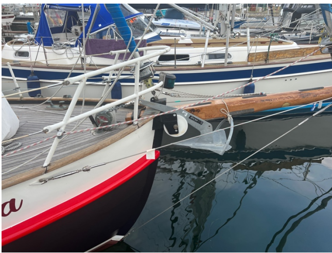
15 Kg Solid Rocna Anchor