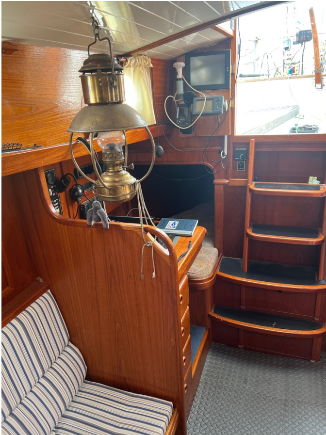
A spacious chart tabel with behind a Pilot bed for storage and sleeping